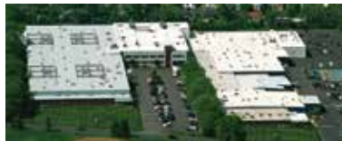
Corporate headquarters, Danboro, PA