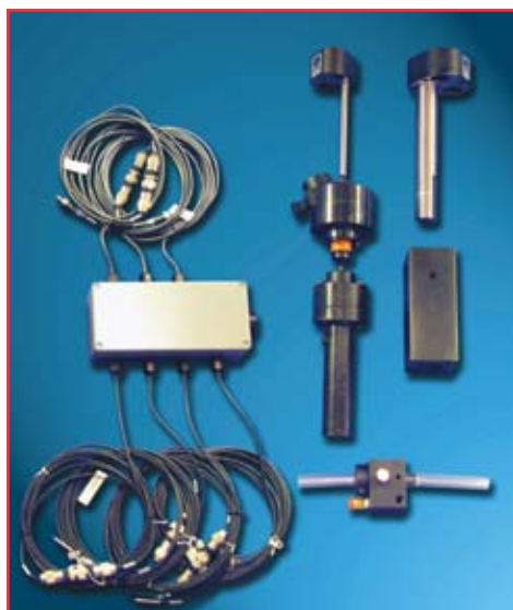
Standard tooling kit.